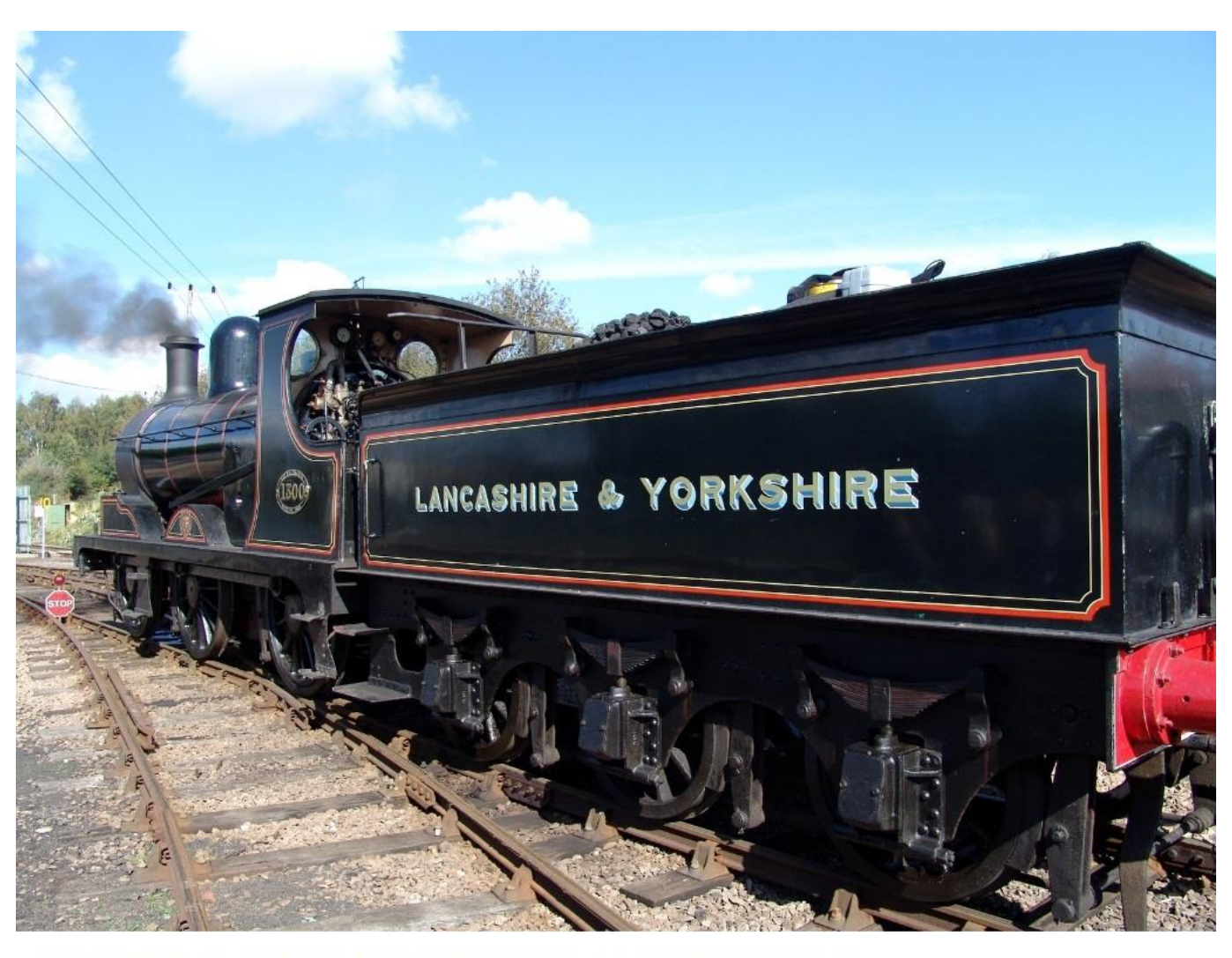
Number 1300 steam engine built in Horwich in 1896 for the Lancashire & Yorkshire Railway.