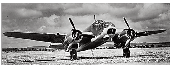
The RAAF Number One Operational Training Unit were in a Beaufort aeroplane like this one

In 1997, the Governor General of Australia issued a proclamation, formally declaring Remembrance Day and urged all Australians to observe one minutes si-