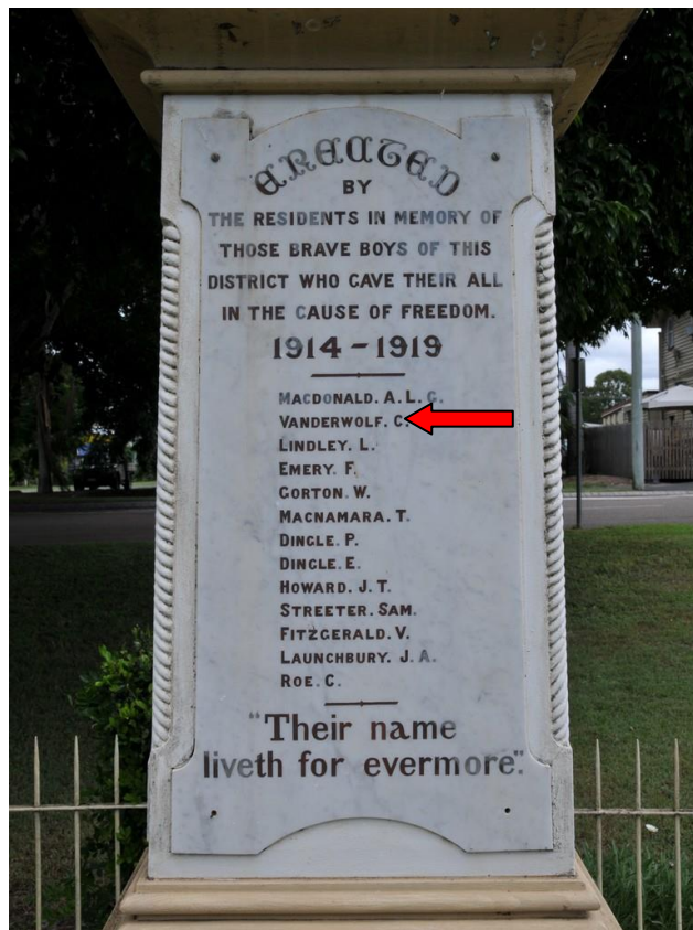
Miriam Vale War Memorial