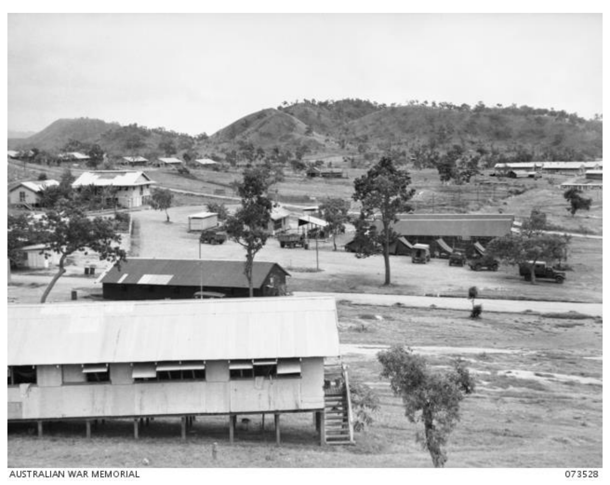
Detached to 5<sup>th</sup> Australian Base Sub Area (Communications) in New Britain 30 December 1944