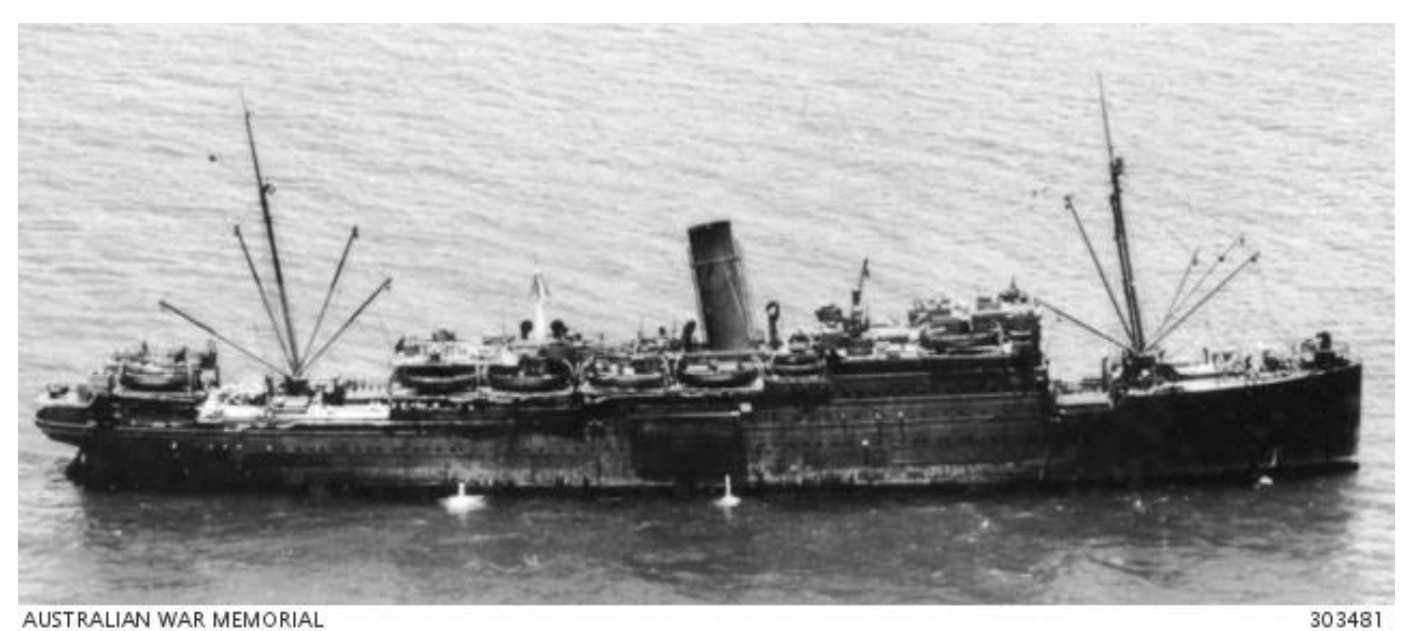
Arrived Port Moresby 15 November 1943 and attached to New Guinea Details Depot (below)