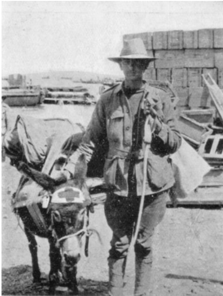
Simpson and his Donkey