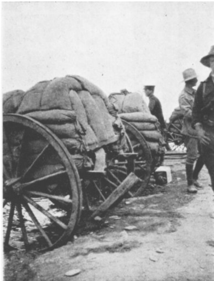
Water Carts protected by Sand Bags