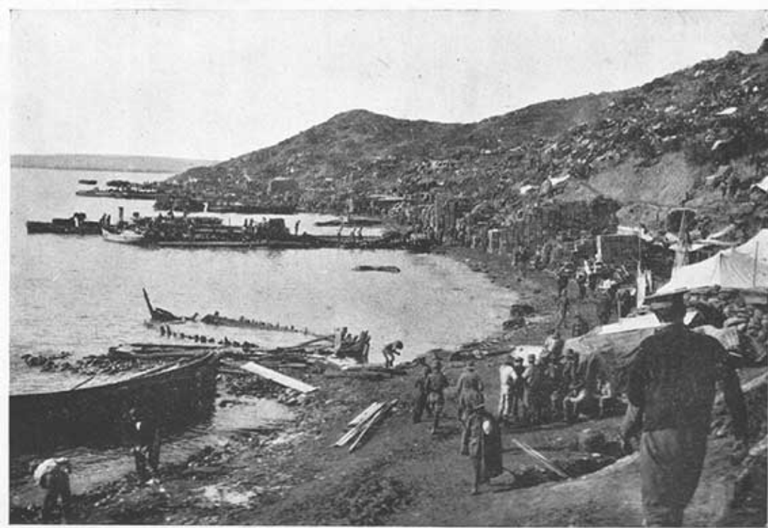
ANZAC COVE.