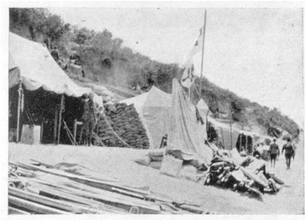
4th Field Ambulance Dressing Station on the beach.