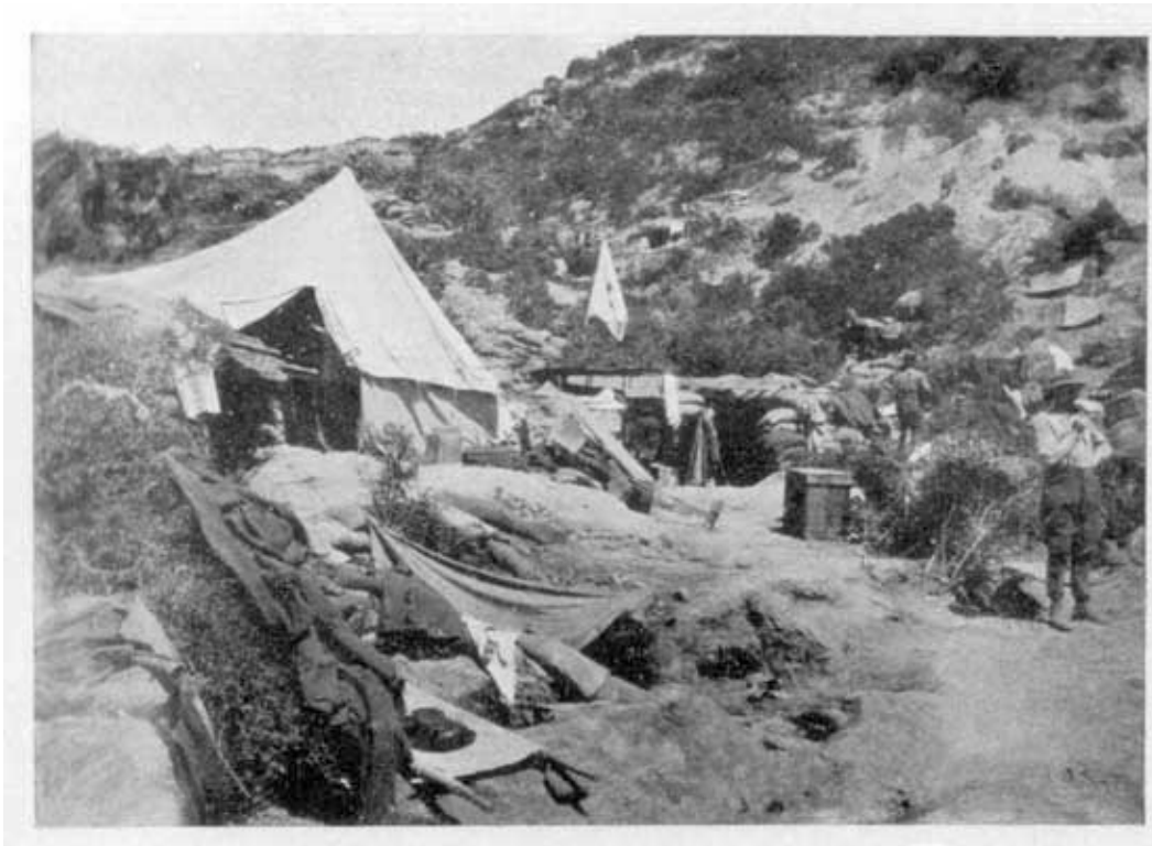
4th Field Ambulance in Head Quarters Gully.