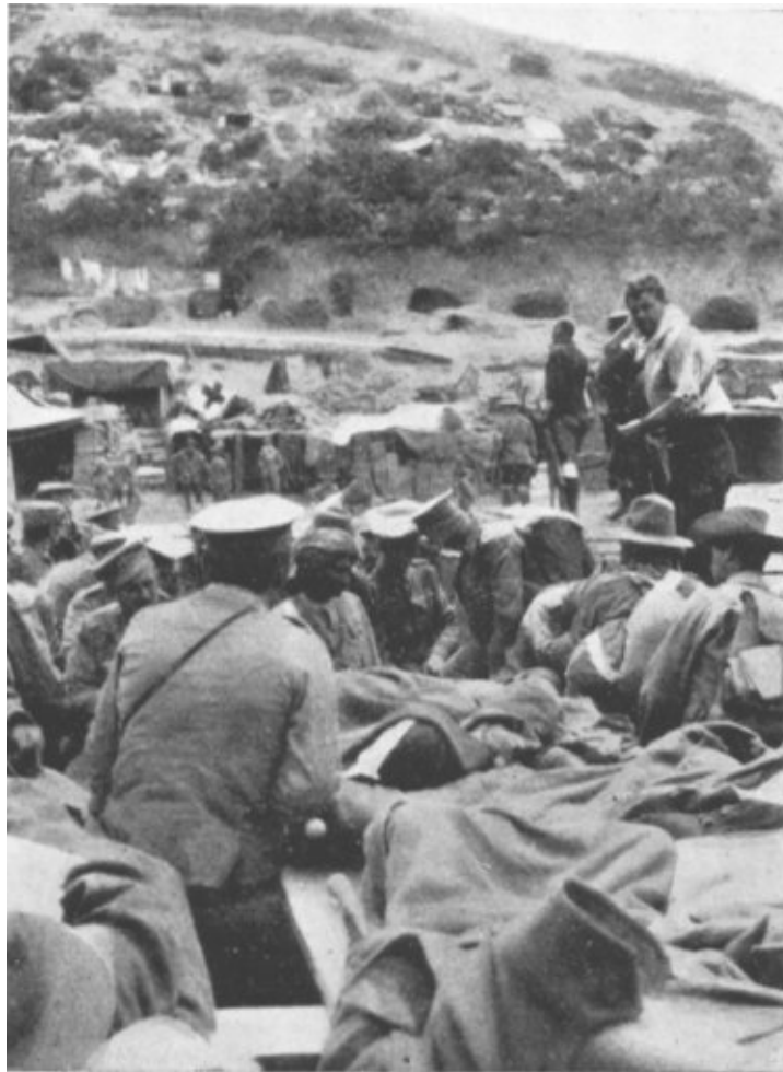
Getting Wounded off after a Fight.