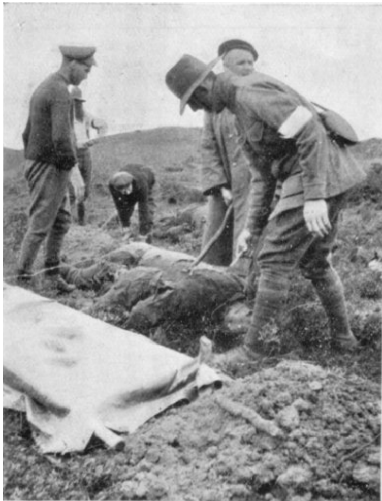
Burial Parties during the Armistice.