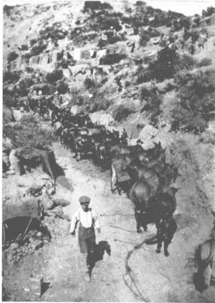
Mules in a Gully.

All the graves were looked after by the departed one's chums. Each was adorned with the Corps' emblems: thus the Artillery used shell caps, the Army Medical Corps a Red Cross in stone, etc.