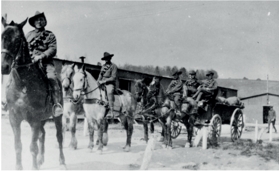
A horse drawn general service wagon at the entrance to an A.I.F. Artillery Camp, Heytesbury, England.

The men of the FAB experienced appalling road and weather conditions and as they came close to the front line often came under long-range enemy fire. It must have been unnerving for 39848 Gunner Duperouzel to sit on a truck, or wagon, full of ammunition whilst shells were exploding all around him.