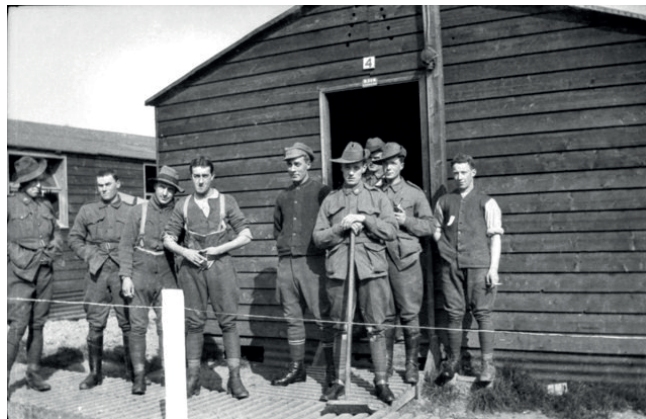
Australian Soldiers at Heytesbury Camp