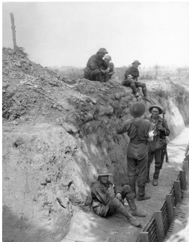
Australian 49th Battalion Battle of Messines, 7 June 1917