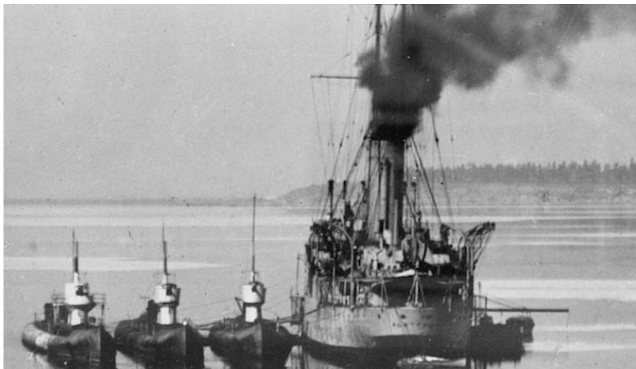
HMAS Platypus alongside three J Class submarines, c.1922