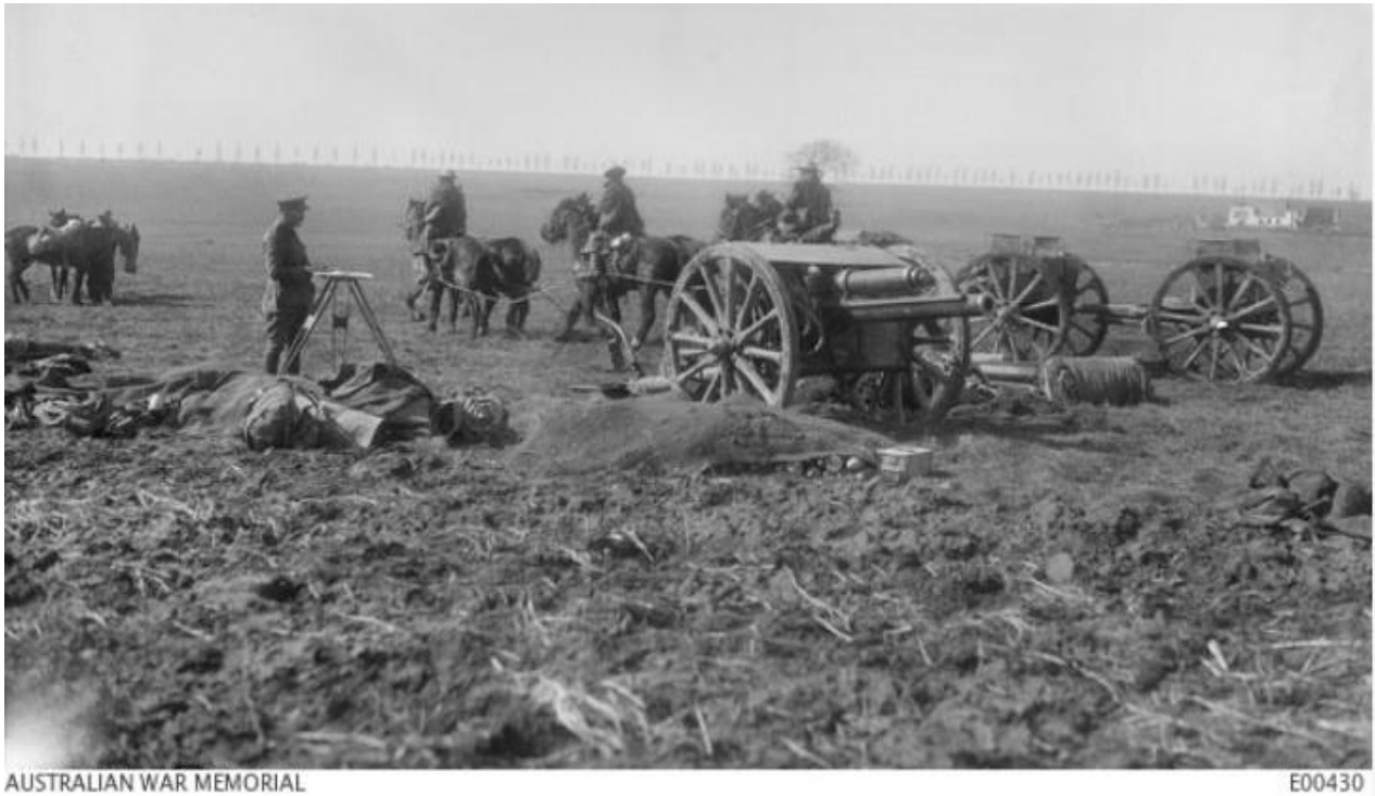
The 12 th Australian Field Artillery Brigade preparing an 18-pounder battery site behind Vaulx, for registration on Lagnicourt, 20 March 1917.

The brigade provided fire support for the Australian capture of Lagnicourt in March 1917, but artillery was not required for the first attack on Bullecourt on 11 April, which ended in disaster, although the 12 th FAB provided fire support for the second attempt on 3 May.