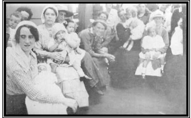
Figure 40: Mothers and babies on board

15. Church Parade. Faith or no. Saw two sailing vessels.