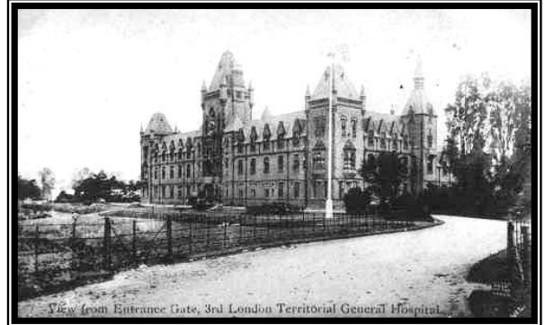
Figure 35: Above - Wandsworth Hospital, London

3. Left at 10a.m. for Edinburgh – My Lady – Arrived before 8p.m. Walked along Princess St. – Punch & Judy Show – Open air service.