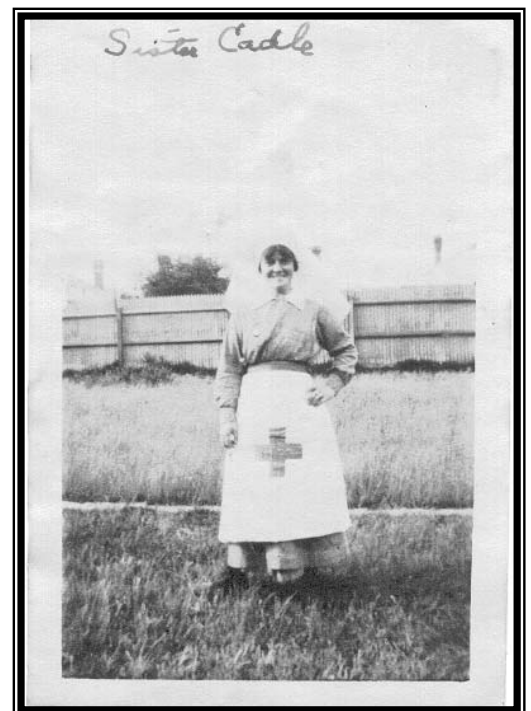
Figure 38: Written on back of photo: It's not a nice thing – but it's me – corsetless -greyfrocked & aproned – with a white military screen cover to protect my grey apron from the grease of the spinal beds - in short - my night duty rig out. I ought to be ashamed to send to round, but I'm rather partial to it myself-more so as I think my dear old Mother will think me “a disgrace” & I love shocking her. N.B. Taint a wearin' a decoration but a watch on my right chest.

Off in p.m., went through some letters. A very nice letter from Sister Cadle.