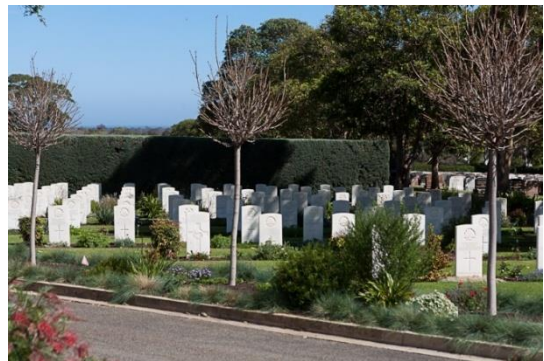
Figure 8 Centennial Park Cemetery