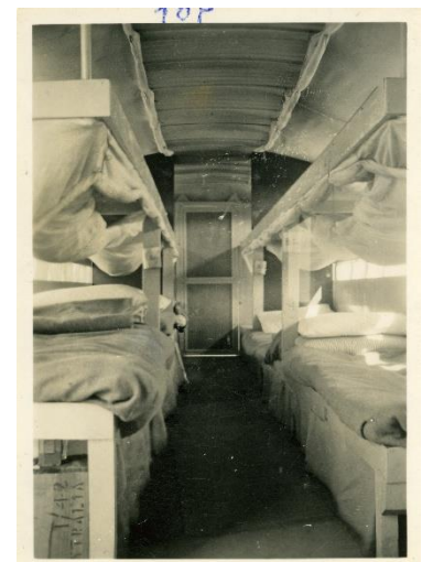
Figure 5 Interior of Ambulance Train

sunk in 1941, which may have influenced her decision to join the A.A.N.S. (Muswellbrook Chronicles, 1941; Virtual Memorial, n.d.). Originally converted from cattle trucks, the train created a harsh and unpredictable working environment, with capacity for forty-eight patients (Queanbeyan Age, 1942). As Lorna described, "Doubtless this conjures up in your minds smooth running carriages... but let me tell you about our own special model!" She detailed the "temperamental" little burners, minimal ventilation, and draughty bunks (See Figure 5 for train interior), noting that "light and ventilation are supplied by eight-inch apertures... which create ample draught when the train is moving" (Laffer, 1939; See Appendix J). Lorna worked with fellow Adelaide nurse Eileen Quinlin (See Figure 6), tending to burns, shrapnel wounds, and tropical illnesses, often with limited medical supplies. The journey was far from safe, Darwin was bombed more