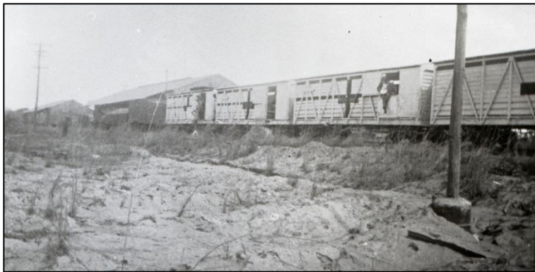
Figure 4 Ambulance Train