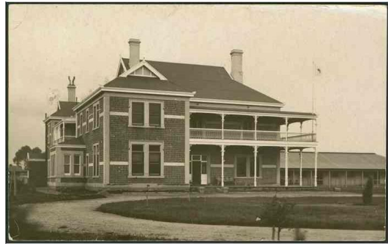
Figure 3 Mareeba Babies' Home c. 1920