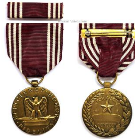
Figure 6: A photograph of a Good Conduct Badge (Veteran Voices Military Research, 2022)