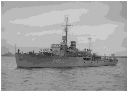
Figure 4: HMAS Katoomba (J204), Bathurst-class corvette active in convoy escort and minesweeping operations