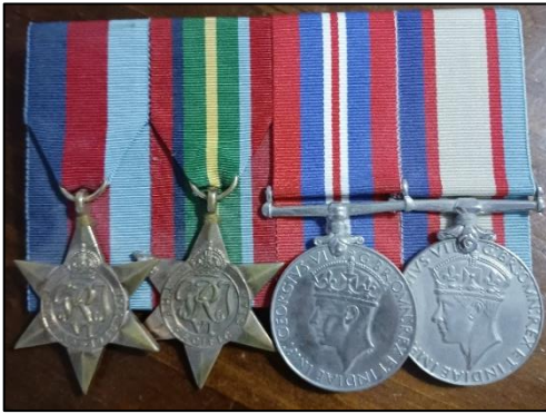
Figure 6 – Photograph of Gil's medals earned in service. Artefact photographed by Grace Wegner on 13/7/2025