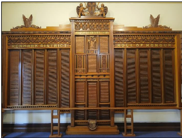
Figure 9 – Photograph of the Renmark District Honour Board inside the Renmark Institute.