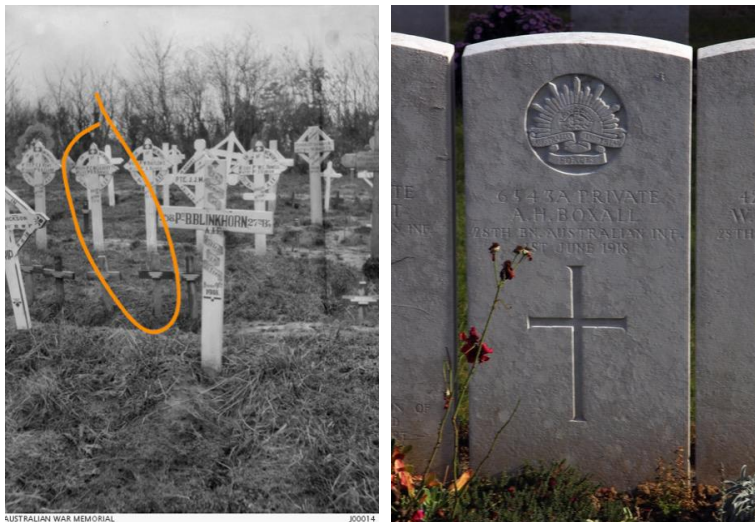
Figures 14 / 15: AWM Roll of Honour 15