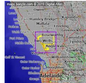
Figure 1, Location of Two Wells, SA