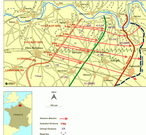
Figure 3, Australian battle plans for the assault on Amiens