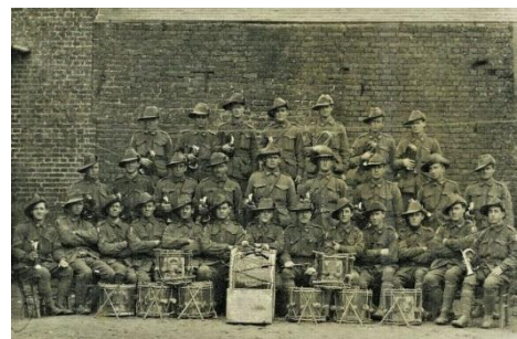
The Australian 48 th Infantry Battalion