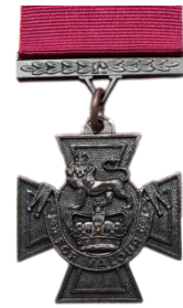
Figure 5, The Victoria Cross