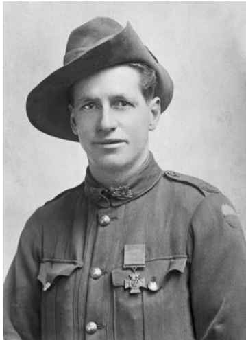
Figure 6, James Park Woods with his Victoria Cross

Thankfully for Jimmy, this would be the last battle he and his comrades would ever fight in. It would not be long until the Germans surrendered, and according to awm.gov.au, the 48th Infantry Battalion would officially be disbanded on the 31st of March 1919. However, Jimmy had one more thing to do; he would receive the Victoria Cross, the highest and most prestigious military decoration in the Commonwealth (Figure 5). He would travel to Buckingham Palace to receive his medal, which, according to The National