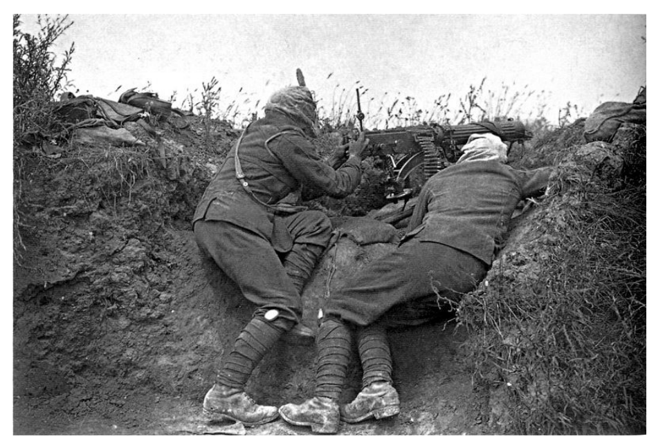
A Vickers MG crew (wearing gas masks) firing at the enemy.

2 MG Company moved out of the front line on the tenth and to a training camp near Renninghelst. It remained in the Ypres area until mid-November, experiencing wet, miserable weather and sporadic attacks by enemy aircraft. It suffered a number of casualties while many of the men had target practice, shooting at German aircraft. During all of this, it would appear that Frederick remained unscathed.