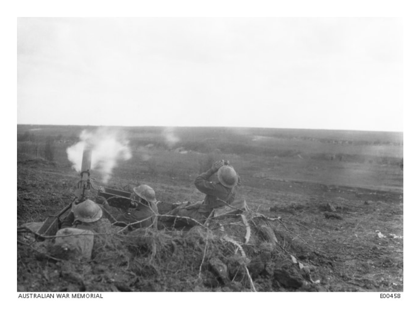
Members of 22 MG Company firing at enemy aircraft, Bullecourt, April 1917

direct fire on to any target that presented itself on that front and in the direction of Bullecourt. A foothold was established in the Hindenburg Line and was held despite a German counter-attack. However, little more was achieved, and the cost to 1, 2 and 5 Divisions over a period of fourteen days was 7 000 casualties.