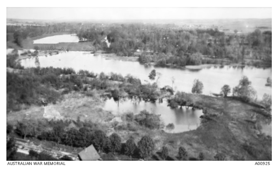
The Somme near Vaux, 1918. The various lagoons made combat difficult in this area.