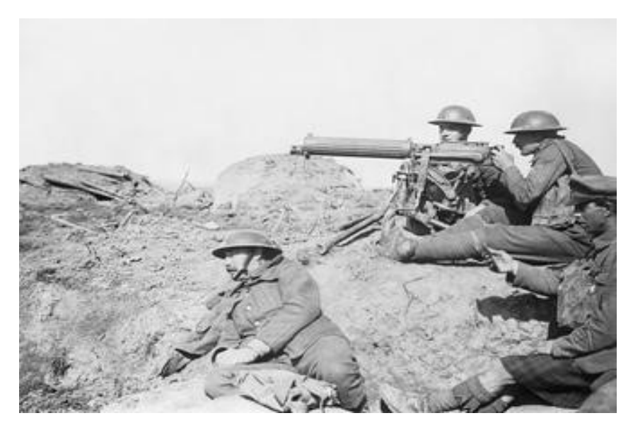
British machine gunners, Menin Road, 21 September 1917

The next day, the Germans counter-attacked again, but were repulsed once more. One machine gun brought down an enemy aircraft.