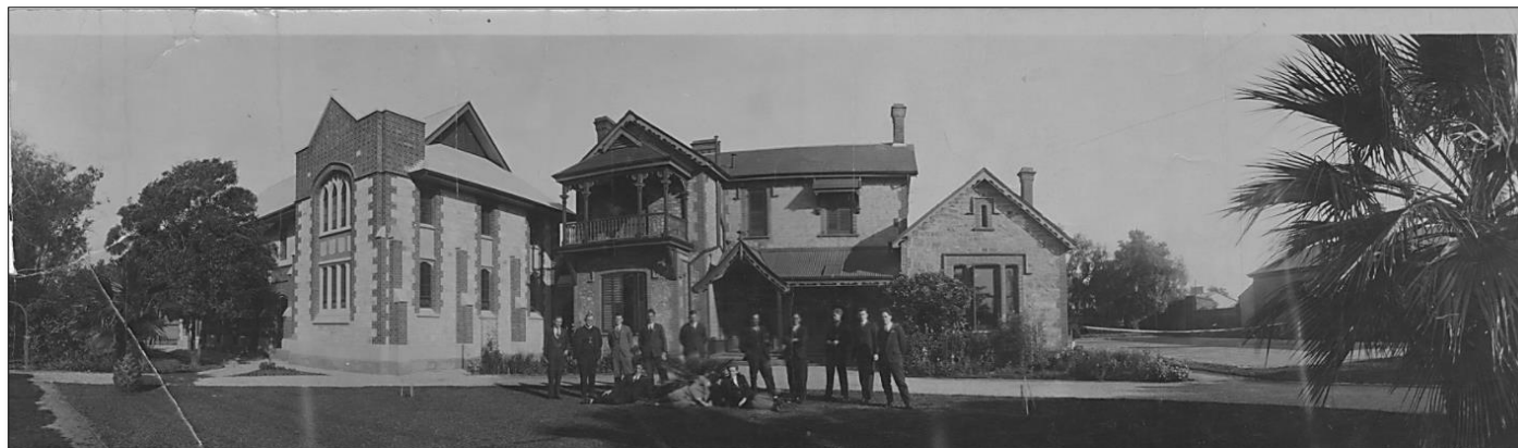
State Library of South Australia