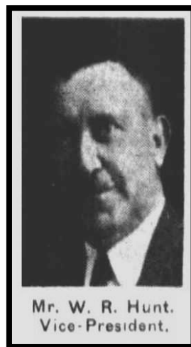
"Executive officers of the Mount Gambier Branch of the A.N.A." Border Watch (Mount Gambier, SA : 1861 - 1954) 17 October 1935