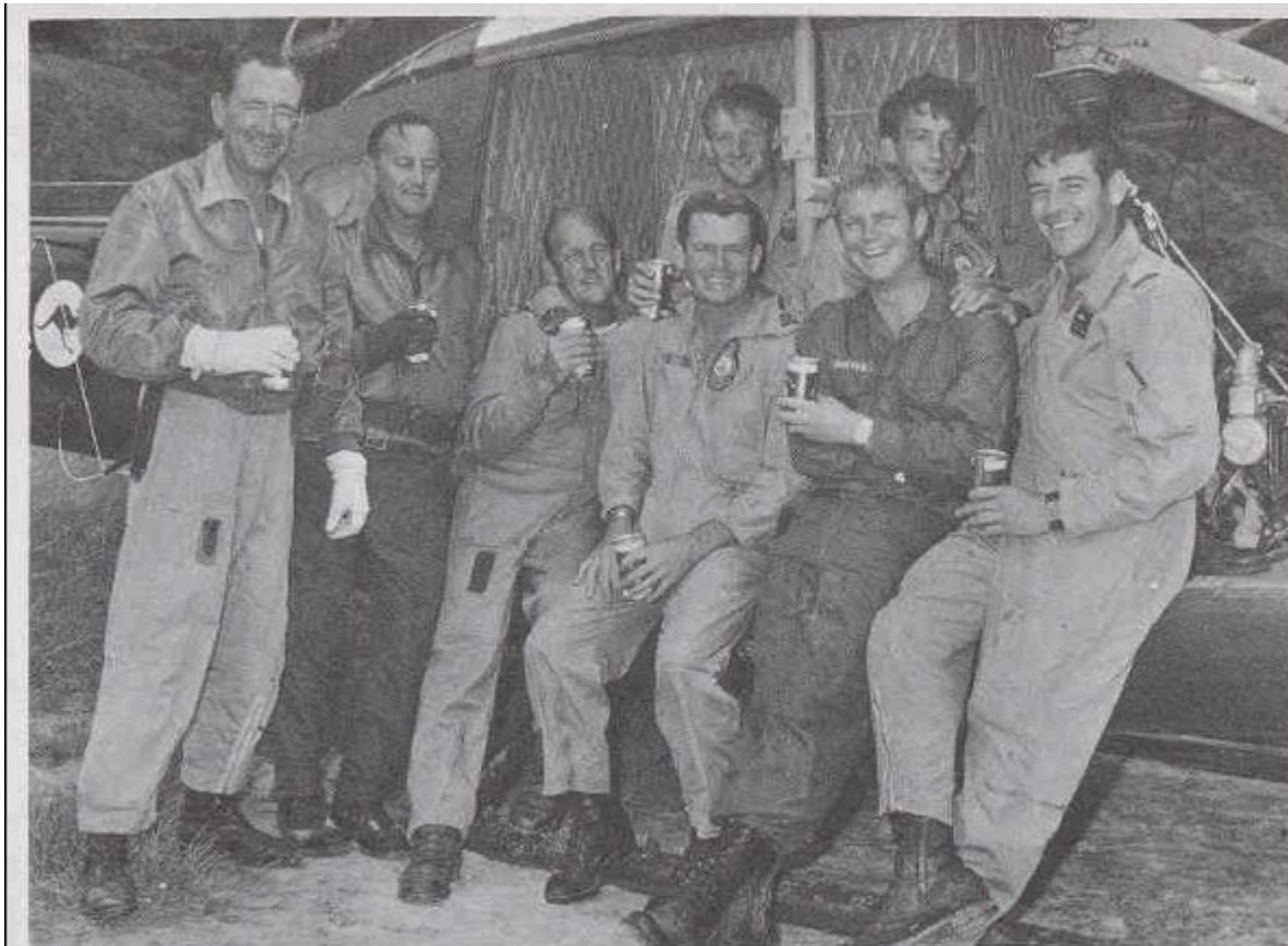
● Mission successful, the RAAF helicopter crews relax and enjoy some well-earned refreshment.