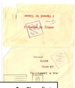
Figure 3: The first letter Frederick Little sent back to Roma along with the envelope.