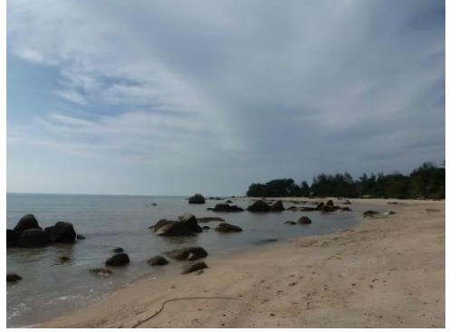
Figure 10 Cox AC (2015) Radji Beach today [photograph], Find My Past, accessed 10 May 2023.

sang together and paid the ultimate sacrifice together, in service of the country, their patients and their families.