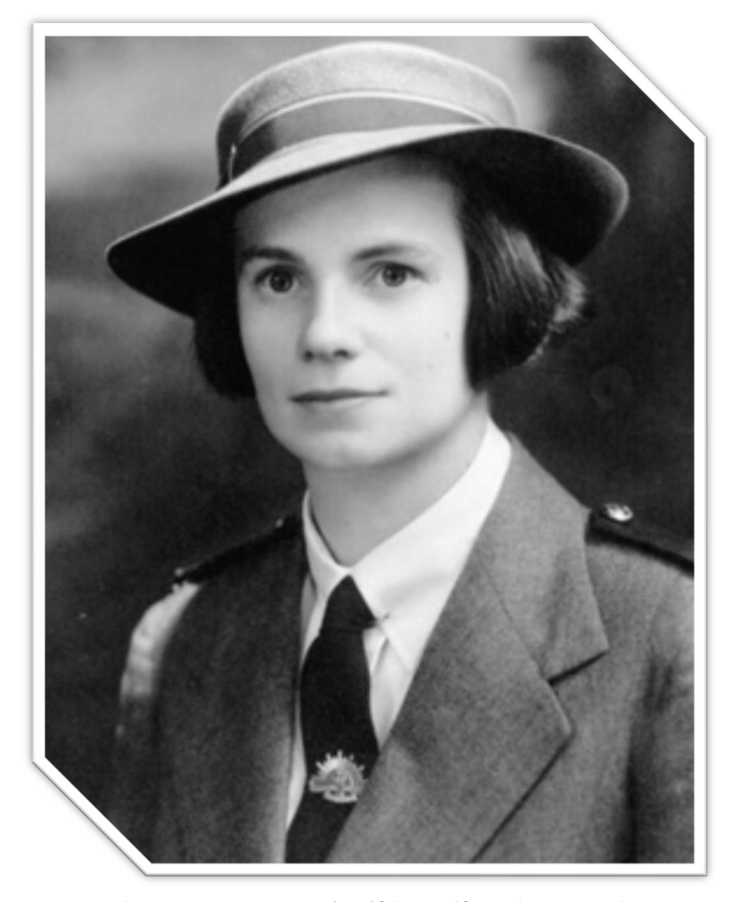
Figure 1 Elaine Lenore BALFOUR-OGILVY (2023) [photograph], Virtual War Memorial, accessed 9 May 2023. <a href="https://vwma.org.au/explore/people/12371">https://vwma.org.au/explore/people/12371</a>

11<sup>th</sup> of January 1912 – 16<sup>th</sup> of February 1942