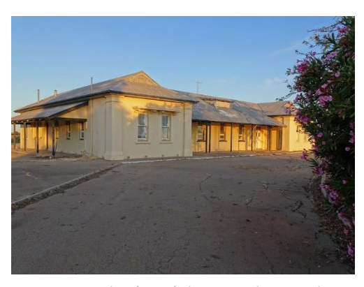
Figure 2 Denisbin (2017) the original Renmark High School that Balfour-Ogilvy attended in the present day [photograph], Flickr, accessed 9 May 2023.

Upon arrival at the Malay Peninsula, Elaine and her fellow nurses were split into small groups and started connecting with local communities and undertaking their roles. Through