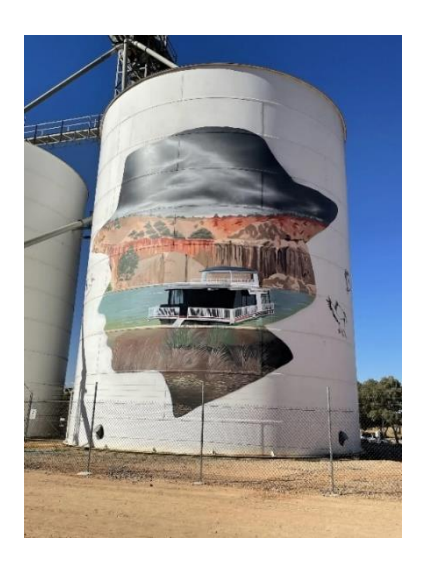
Figure 12 Annette Green AG (2021) Sister Elaine Balfour-Ogilvy silo art [photograph], Australian Silo Art Trail, accessed 12 May 2023. https://www.australiansiloarttrail.com/paringa

https://recordsearch.naa.gov.au/SearchNR etrieve/Interface/ViewImage.aspx?B=6397