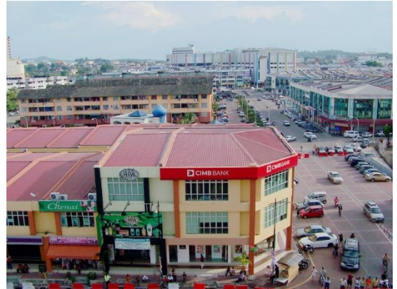
Figure 8 Kluang today (2023) [photograph], Wikipedia, accessed 12 May 2023.