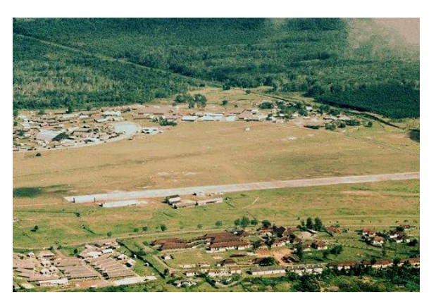
Figure 7 Biggadike PB (1957) KLUANG AIRFIELD [photograph], JANVISION GALLERY, accessed 9 May 2023. http://www.users.waitrose.com/~q8jan/index.html

rather than be passively slaughtered by a callous enemy. <sup>16</sup> There was only one survivor of the massacre, Lieutenant Colonel Vivian Bullwinkel who pretended to be dead, after being struck by a bullet. She would eventually re-surrender to the Japanese and survive POW camps to return to Australia and share much of this story.