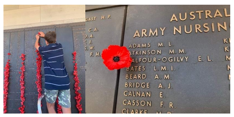
Figure 14 Files BF (2023) Putting a poppy in the sister Elaine-Balfour-Ogilvy memorial at the Australian War Memorial in Canberra [photograph], Ben Files, accessed 19 May 2023