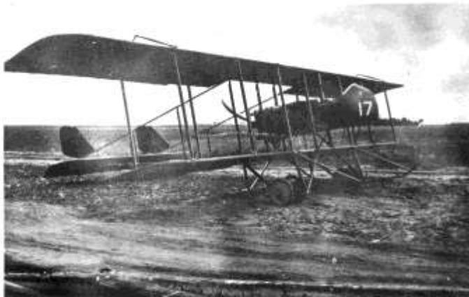
Maurice Farman Shorthorn trainer at CFS Point Cook during the First War.