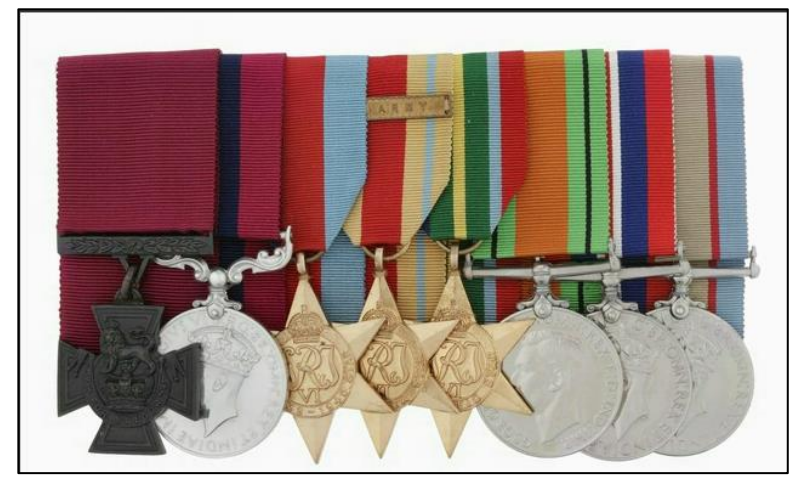
Figure 3: Tom Currie Derrick's medals as displayed in the Australian War Memorial (L-R) Victoria Cross, Distinguished Conduct Medal, 193945 Star, Africa Star, Pacific Star, Defence Medal, Commonwealth War Medal 1939-45, Australian Service Medal 1939-45