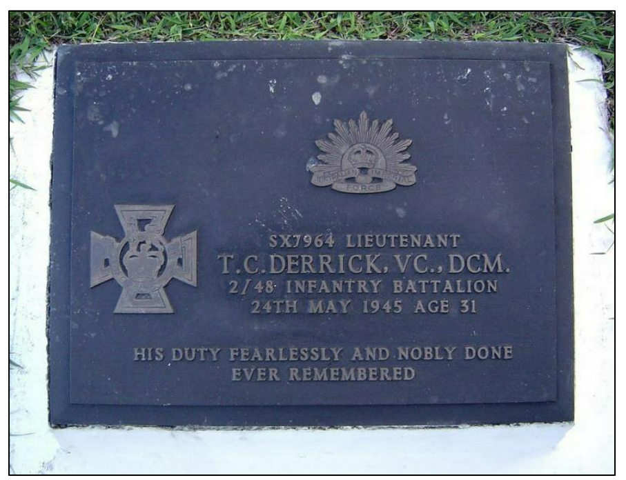
Figure 4: Lieutenant Thomas Currie Derrick's Burial Stone

He died the next day, just months before the end of World War II, at the age of 31. Tom is buried at the Labuan War Cemetery in Malaysia (Figure 4) and in the year 2000, was commemorated on a postage stamp by Australia Post (Figure 5).