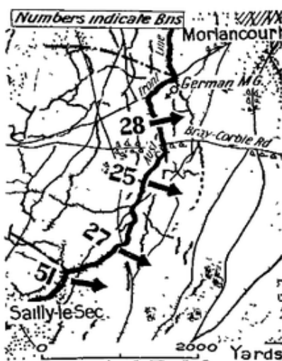
Figure 5: The starting places of battalions in the battle of Morlancourt