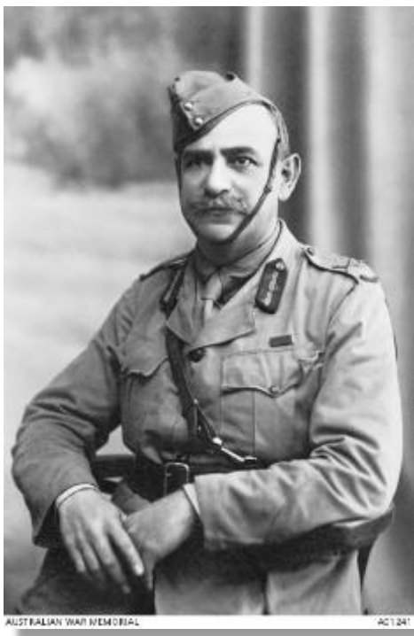
Figure 2: Lieutenant General John Monash

There was a push from Australian forces and the government to fight under their own leadership instead of British command; largely generals with scant attention to detail or regard for human life. By June 1918, command of Australian forces was given to Lieutenant General John Monash vi , who had made a name for himself on Gallipoli and in France as a meticulous planner and successful leader. Monash was an Australian Reservist before the war, with a background as an engineer. His talents as a strategist and planner would become invaluable for what lay ahead vii . Monash would be in charge of the Third Battle of Morlancourt, which would be used as a prelude to the famous battle of Hamel less than a month later, in which his planning would be acknowledged as the most meticulous of the war, and result in a spectacular victory for the Allies.