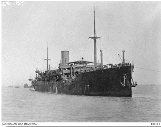
Figure 3: HMAT Ballarat (A70)