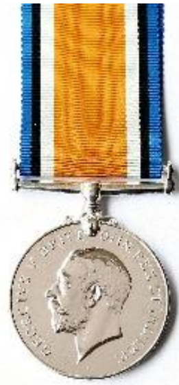
Figure 6: British War Medal