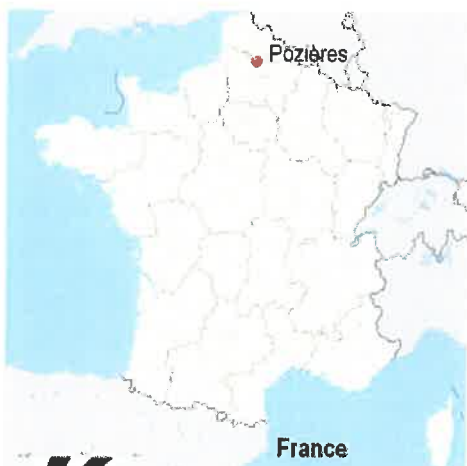
Figure 3 - The small village of Pozières situated in Northern France.

Leaving the Battle of Armentieres, Arthur moved on to what was to be his most notable battle, the Battle of Pozières. Pozières is a rural village situated 130 kilometres from Paris in Northern France. The village was vital to enemy defences for it provided an observation post overlooking the surrounding countryside. Between July and August 1916, the small village of Pozières became the centre of one of the bloodiest battles of WWI. Arthur's actions during this battle earned him the Victoria Cross. His gallantry during the several hour ordeal, showed his skill as a leader. He led his men in the noblest way - by example. Arthur's actions exemplified the honour and bravery that any Anzac soldier would be proud of.