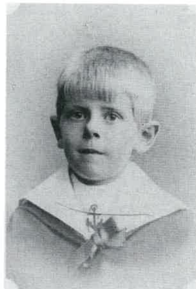
Figure 1 - The earliest existing photo of Arthur Blackburn.

There is a type of soldier revered around the world; these are known as the Australian New Zealand Army Corps, or better known as the ANZACS. These are the soldiers who created the Anzac spirit; a spirit full of compassion, courage, endurance, determination and loyal mateship. This spirit is well described by war historian, C.E.W. Bean: “Anzac spirit stood and still stands, for reckless valour in a good cause, for enterprise, resourcefulness, fidelity, comradeship and endurance that will never own defeat.” 1 Arthur Blackburn was a soldier who epitomized this spirit. He was the first South Australian to be awarded the Victoria Cross in World War I. Arthur proudly represented his country in both World Wars and was a founding member of the South Australian Returned Servicemen’s League.