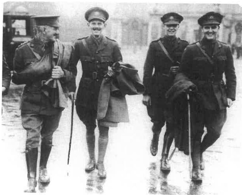
Figure 8 – Arthur Blackburn (second left) leaves Buckingham Palace after being presented with his VC by King George V, 1916.

The Anzac spirit is something intangible that is carried throughout life and reflected in everything you do. Not all battles are fought in the theatre of war. Arthur fought for many things throughout his life and by no means did he see it as an opportunity to distinguish himself. With only the outcome in mind, he undertook them with a sense of righteousness befitting the Anzac legend and its traditions. To do honour to the Anzac tradition is to be mindful of the words of Arthur Blackburn himself. Arthur said in the RSL newspaper 'Back' in 1947: "...let your thoughts be for those who died in the Anzac tradition, and let your deeds be worthy of them and the country which they and you served" 4 .