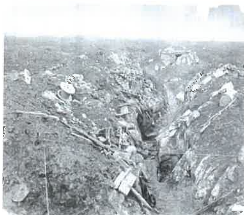
Figure 5 - OG1 trench after battle.