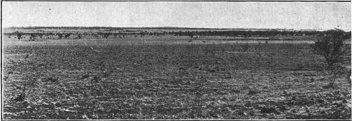
GENERAL VIEW OF "SUSSEX PARK."

in business, and is now occupied with duties connected therewith, having during the interval donned the khaki at his Country's call and contributed his "bit" as a