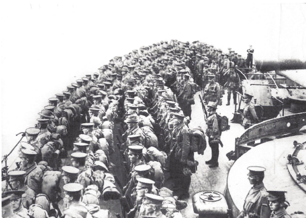
Australian soldiers drawn up before the landing on troop deck at Gallipoli Peninsula, Turkey [picture] Date(s) of creation: [1935] Photograph printed in 1937 from original in 1915.