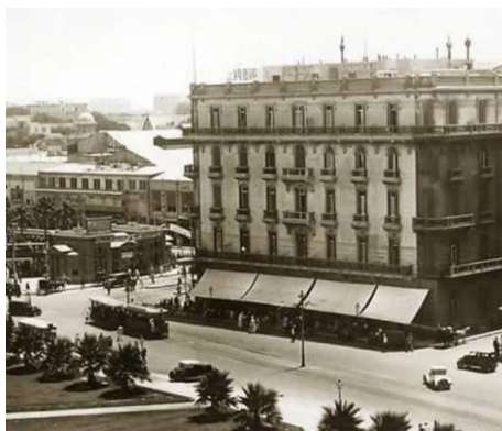
Le Metropole Hotel, Cairo Circa 1937